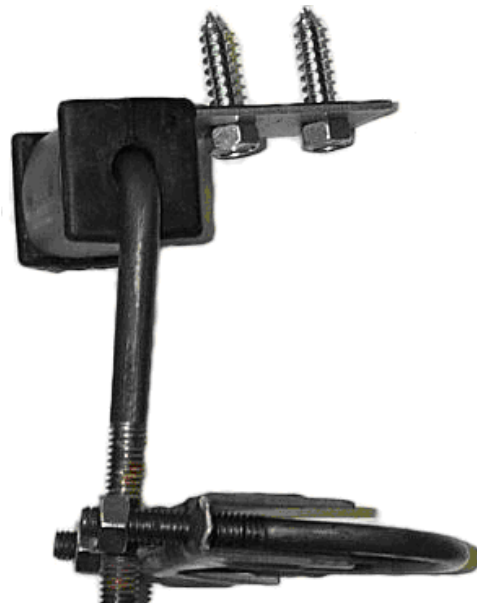
Front tail pipe hanger assembly